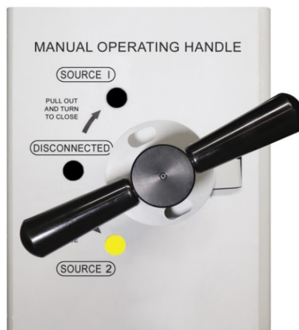
Figure 5. DISCONNECTED (from SOURCE 2) position indicator

Push handle in. Turn handle clockwise until DISCONNECTED position is indicated.