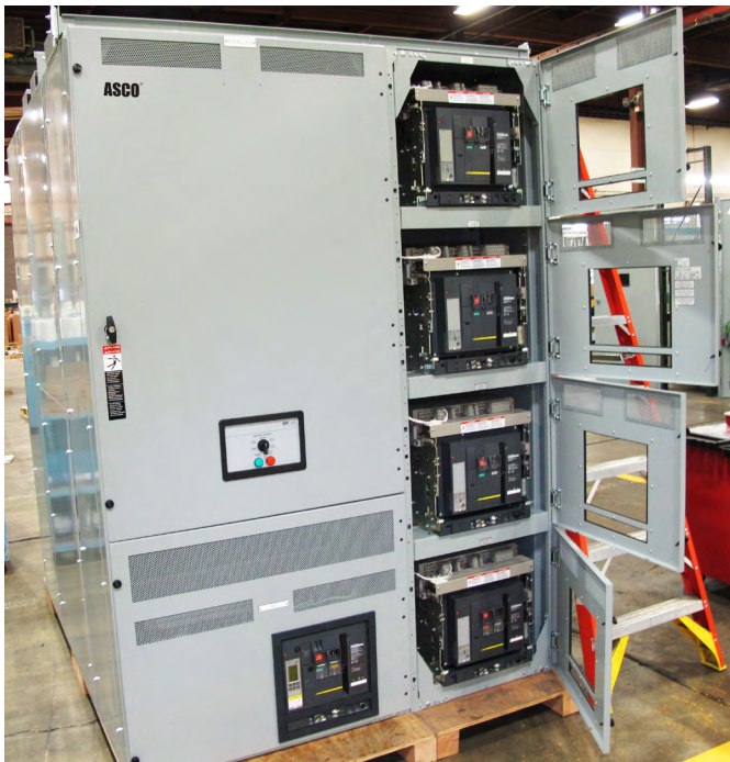
Figure 1: ASCO UL 1558 PCS equipment with UL 1066 circuit breakers.

UL 891 – Switchboards defines safety tests for power control equipment serving circuits operating at nominal ac voltages of not more than 600 volts. UL 891 testing is referenced throughout NEMA PB 2 - Deadfront Distribution Switchboards , the design document from which UL 891 was developed. Compartmentalized construction is not required by UL 891. In practice, some major PCS manufacturers incorporate UL 1558 compartmentalization into their equipment regardless of whether UL 891 or UL 1558 ratings are required for an application.