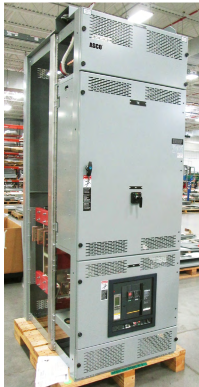
Figure 4: UL 891 Distribution Equipment - If this were UL 1558 equipment, panels would separate the front of the enclosure from the rear, and side panels would enclose the left side.