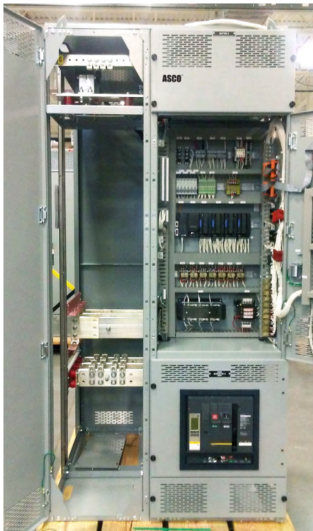
Figure 3: Front-connected UL 891 PCS equipment.