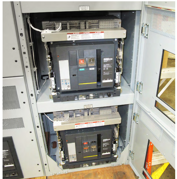
Figure 2: Each draw-out breaker is compartmentalized by grounded barriers.