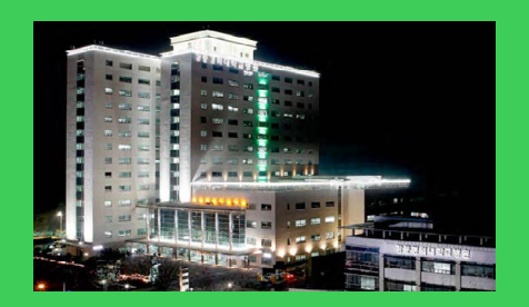
Learn about Kvunghee Hospital