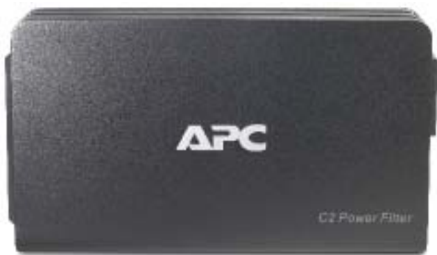
Figure 1. C2/C2-CN Wall Mount Power Filter - Front View

Isolated noise filter bank (INFB) technology eliminates electromagnetic interference and radio frequency interference (EMI/RFI) as sources of audio and video signal degradation, and data line surge protection jacks stop surges from traveling over phone lines.