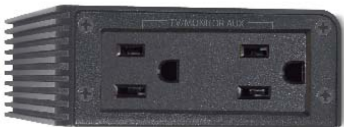
Figure 3. C2/C2-CN Outlet Panel

This section describes outlet panel functionality. The outlet panel for the C2/C2-CN Power Filter is shown in Figure 3. Outlet panel descriptions are provided immediately below Figure 3.