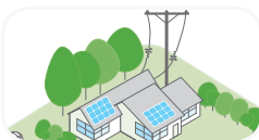
Residential, backup power and grid-tie