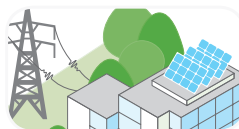
Small commercial, backup power and grid-tie