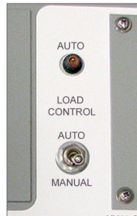
ASCO Automatic Load Control toggle switch shown on load bank control panel.

The ASCO Automatic Load Control is a standard accessory for 1000 SERIES (radiator mount) or 4000 SERIES (outdoor free standing style) load banks.