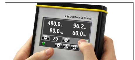
"Digital Toggle" Switch Control Panel and Optional SIGMA LT Hand-Held Controller.