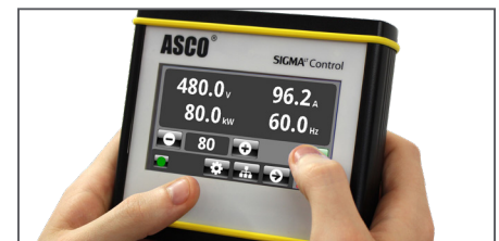
"Digital Toggle" Switch Control Panel and Optional SIGMA LT Hand-Held Controller.