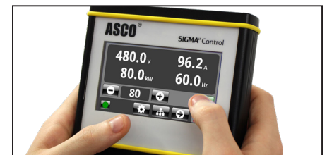
Optional SIGMA LT Hand-Held Terminal.