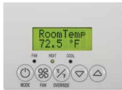
Hotel and Lodging Application

Please refer to the following matrix when ordering controllers: