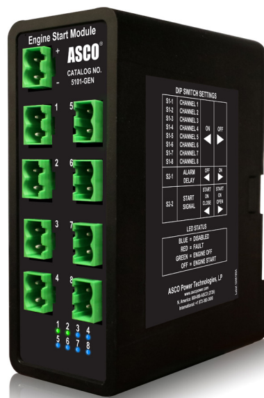
Generator Engine Start Module ASCO Model 5101-GEN

The ASCO Engine Start Monitoring System is the perfect solution for complying with new 2017 NFPA 70 requirements: