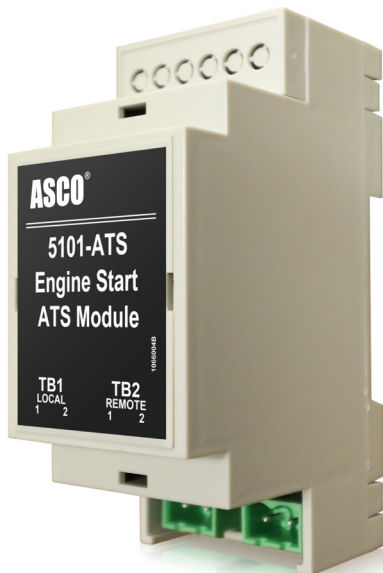
ATS Engine Start Module ASCO Model 5101-ATS

An engine-generator must start automatically when it receives a start signal from an automatic transfer switch. If signaling wires are damaged, an engine will not receive the start signal needed to begin supplying mission-critical power. Without Engine Start Circuit monitoring, facility personnel will never know when wiring is compromised, placing the facility at risk for an extended outage. For this reason, NEC Article 700.10 requires monitoring of engine start circuits to detect compromised wiring.