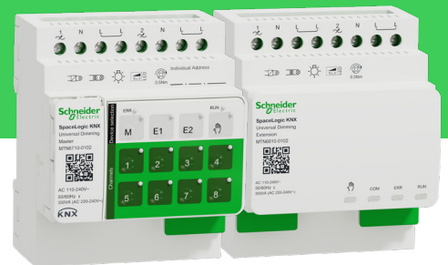
SpaceLogic KNX Actuator Range Series

The benefits go further, with energy savings and reliability enough to excite any building manager, and features and functionalities designed to add comfort for building occupants.