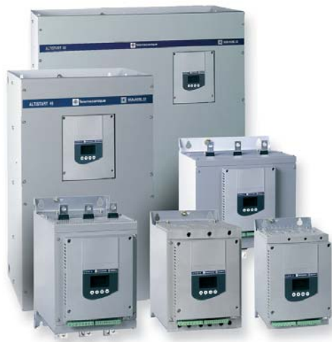
ALTISTART® 48 Family