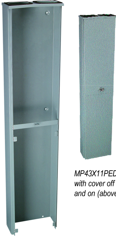
MP43X11PED shown with cover off (left) and on (above)

These Underground Service Wireways are not load-bearing; they are intended for use only as a means to cover and secure service entrance cables prior to entering a wall-mounted SQUARE D MP METER-PAK device. The units connect easily to any MP METER-PAK Meter Center by attaching to tapped hub provisions in the bottom endwall of the metering device.