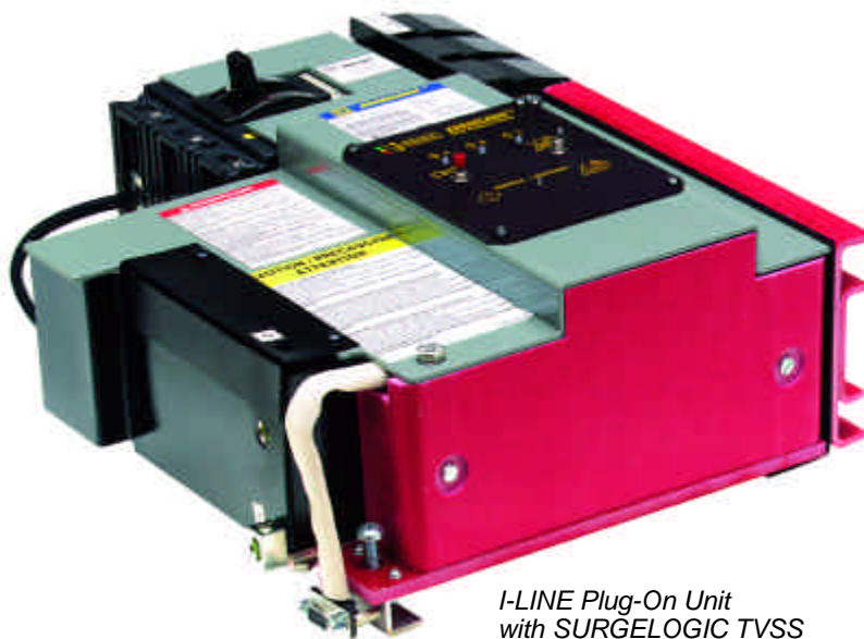
I-LINE Plug-On Unit with SURGELOGIC TVSS

The SQUARE D I-LINE plug-on unit with SURGELOGIC TVSS is ideal for applications where protection of sensitive electronic equipment from transient over-voltages is needed. Designed to plug onto the bus stack of either an I-LINE panelboard or switchboard, this compact, easy-to-install unit can significantly reduce installation time and material cost.