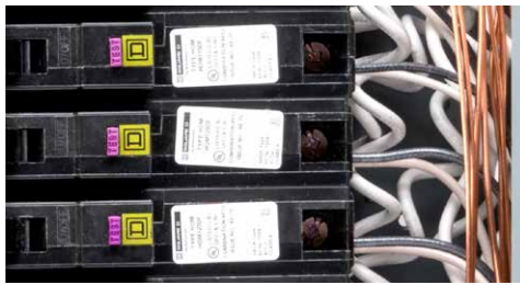
▲ Pigtail Neutral connection