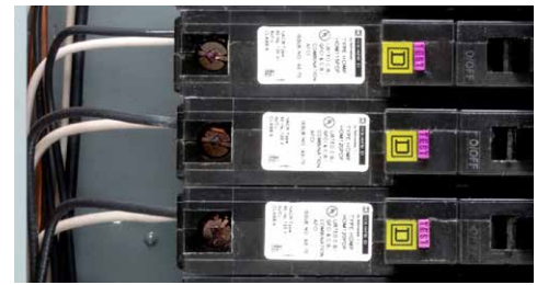
▲ Plug-on Neutral connection