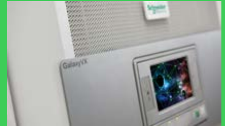
Galaxy VX UPS