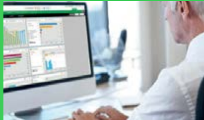
Software and Services