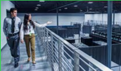
Solutions for Colocation Providers