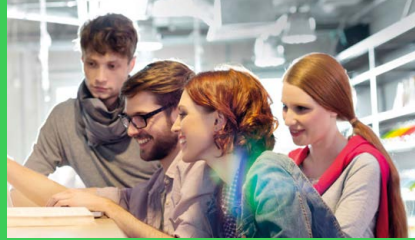
Discover EcoStruxure™ Customer Success Stories