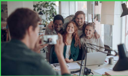
Contact us to start your journey