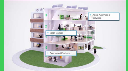
Discover EcoStruxure™ Building