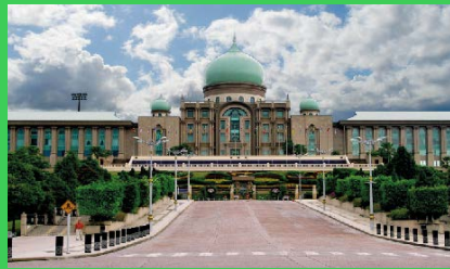
Explore Malaysia's Prime Minister Office