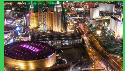
Experience T-Mobile Arena