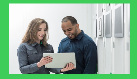
Discover Solutions for Cloud and Service Providers