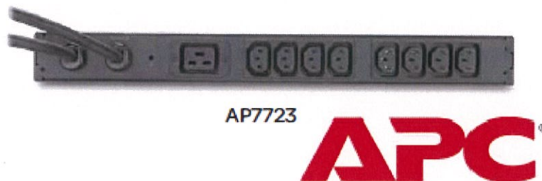
Photo for representative model in AP77xx.

Photos for representative models in AP44xx.