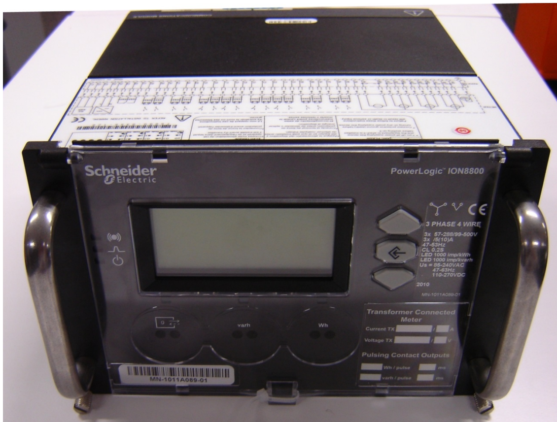
FIGURE 14/2/56 – 1