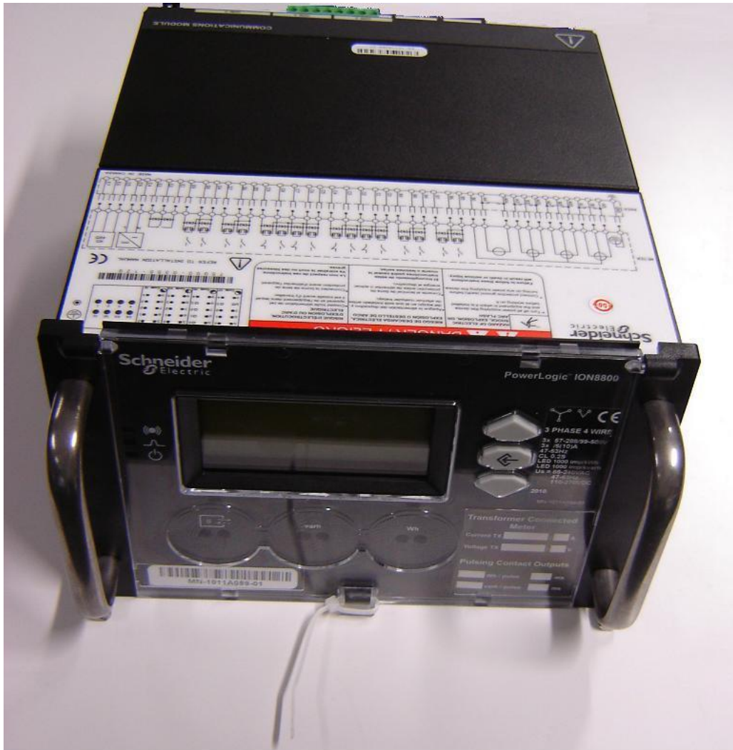
Schneider Electric Model PowerLogic ION 8800 Electricity Meter – Typical Mechanical Sealing