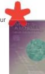
"Harmonics handbook: Measurement, analysis & solutions." Price: 25 € HT