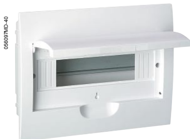
Hollow partition flush mounting kit