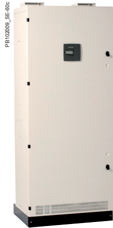
Cubicles A3 and A4.

Varset Fast is an automatic power factor correction equipment presented in a cubicle, including Varplus 2 capacitors, static contactors, detuned reactors (DR), a rapid response power factor controller (step response time < 40ms).