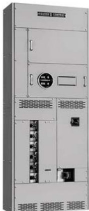
EUSERC UCT, Single Main Circuit Breaker with I-Line Distribution Panel

Visit the online FAQs page to find additional technical information covering all products including discontinued and obsolete products. https://www.schneider-electric.us/en/faqs/home/