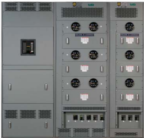
Power-Style™ Commercial Multi-Metering Switchboard Lineup