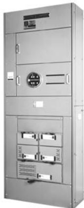
EUSERC UCT, Fusible Multiple Mains