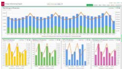
EcoStruxure™ Power Monitoring Expert dashboard (Energy Production sample)