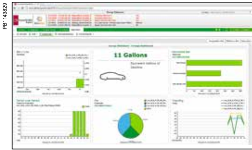
EcoStruxure™ Power SCADA Operation dashboard

EcoStruxure™ Power SCADA Operation is a reliable, flexible and high performance monitoring and control solution designed to reduce outages and increase power efficiency. It is built to handle user requirements from the smallest to the most demanding enterprises, while still providing high time performance and reliability. Easy-to-use configuration tools and powerful features enable faster development and deployment of any size of application.