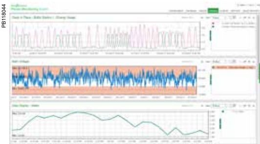
EcoStruxure™ Power Monitoring Expert dashboard (Trends sample)