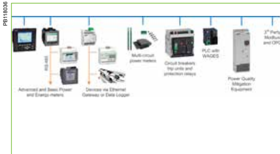
Power SCADA Operation sample Trends display