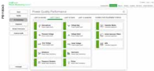
EcoStruxure™ Power Monitoring Expert dashboard (PQ Performance sample)