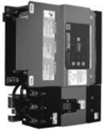
I-Line™ SPD Unit