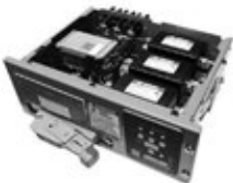
MCC SPD Unit