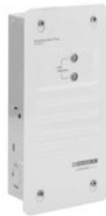
Whole House SPD