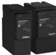
Plug on Neutral QO/CHOM SPDs