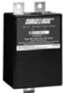
Delta Replacement Module