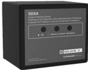
SDSA 3-Phase Series