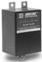
MA Replacement Module