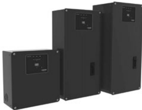
EMA SPD Series

EMA SPD products feature a design based on individual phase modules for a flexible, cost effective way to achieve superior surge suppression at every level of the electrical distribution system. Modularity results in lower life cycle costs and fast, easy service or replacement.