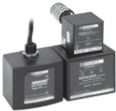
Nipple Mounted SPDs