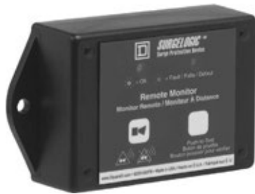
Remote Monitor TVS12RMU