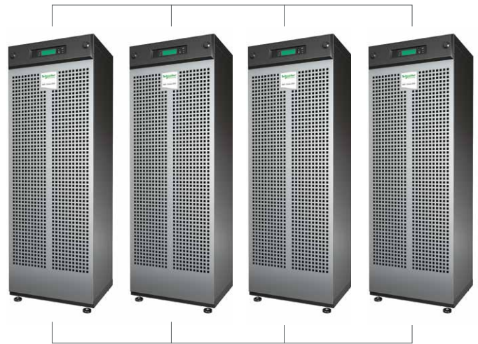
Four units in parallel (3:3 version)