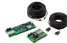
Third-party switchgear kit