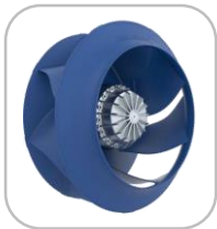
Latest generation Radical EC fans