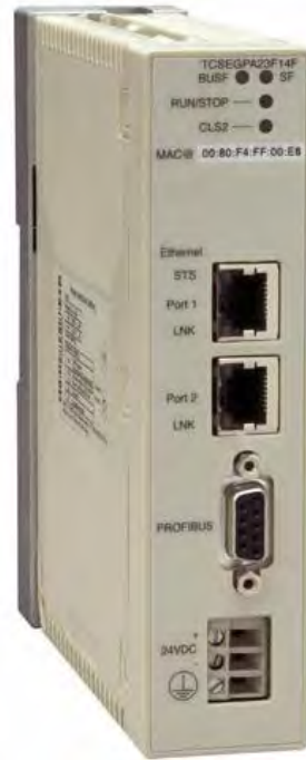
Profibus Remote Master TCSEGA23F14F TCSEGA23F14FK

For further information please contact us on 0870 608 8 608 or visit www.schneider-electric.co.uk