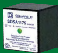
Hard Wired Secondary Surge Arrester