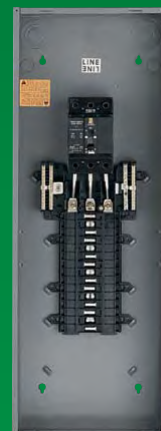
Main Breaker Loadcentres