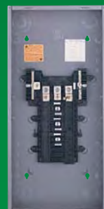
Main Lug Only Loadcentres

QO three-phase loadcentres meet commercial requirements for three and four wire applications ranging from 100A to 600A.