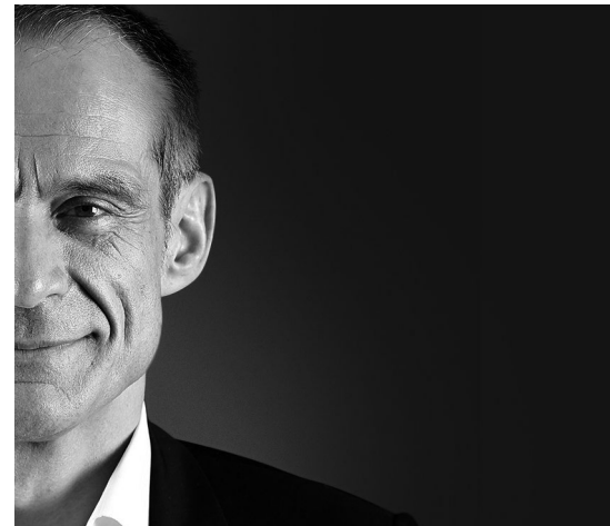
Jean Pascal Tricoire , CEO of Schneider Electric

At Schneider Electric, the basic foundational principles of fairness, equity, ethics and transparency are fully embedded in our values and sponsored by our leaders.