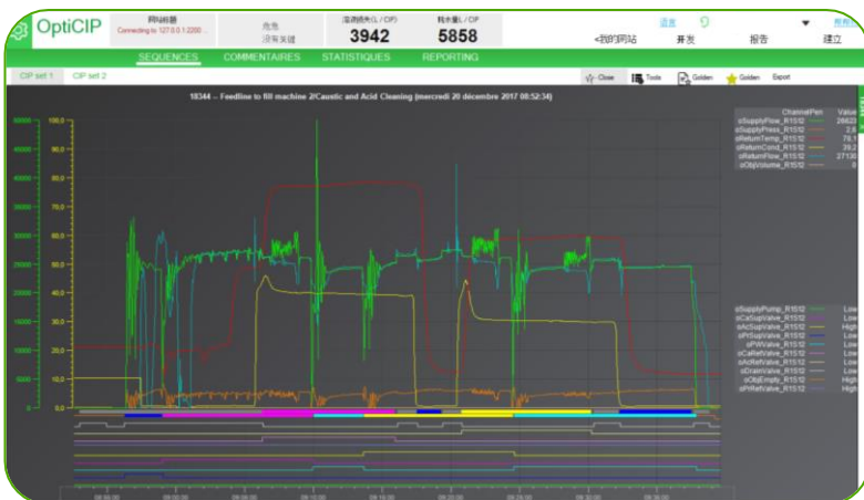
Cleaning cycle analysis