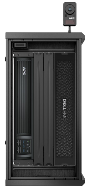
DELL EMC PowerEdge™ XE2420 Edge Server within a Schneider Electric, 6u Wall Mounted Micro Data Center

Schneider Electric and Dell share a channel-partner network spanning the globe, providing IT expertise and management wherever needed.