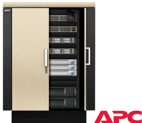
EcoStruxure™ Micro Data Center C-Series for Commercial Environments