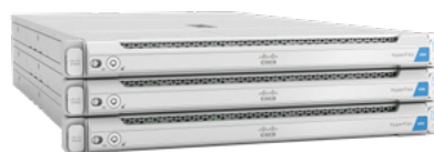
HyperFlex™ Edge nodes