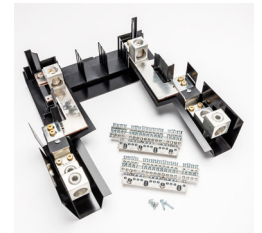
600A NQ Oversized Neutral Assembly with (6) AWG 1/0 to 750 kcmil Neutral Lugs