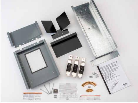
NQMB6PPL 600A Main or 400A Sub-feed PowerPact L Circuit Breaker Kit