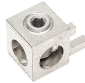
NQ100AN Lug Kit

**Enclosures are 8.75" Deep and 26" wide.