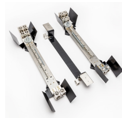
600A NQ Condo Riser Neutral Assembly