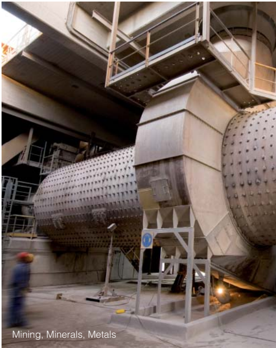
Mining, Minerals, Metals