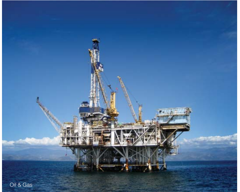
Oil & Gas