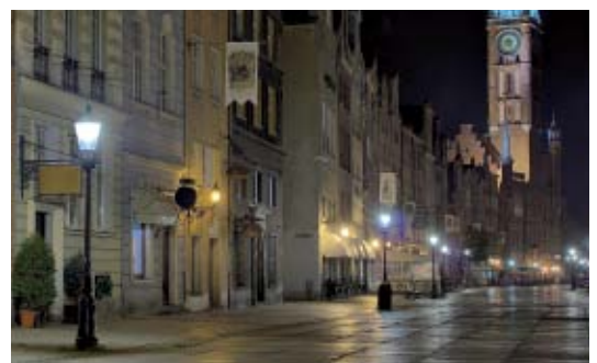
LED street lighting system

iPRI surge arresters protect communication systems that are sensitive to overvoltages.