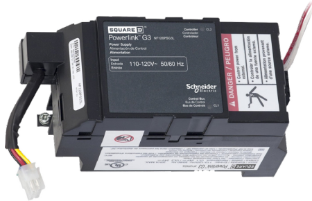
NF120PSG3L Power Supply

Order a sub-net cable to connect Remote Mount Controller to a Powerlink Panelboard