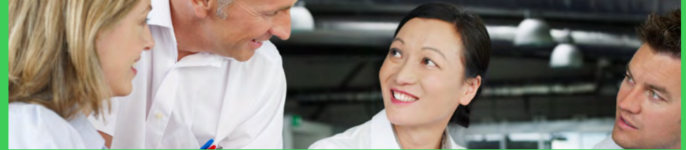
White paper: Mitigating Risks in Mission Critical Facilities