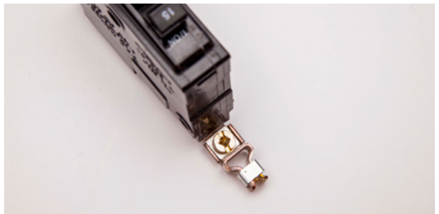
Single phase QOB breaker with jaw kit installed