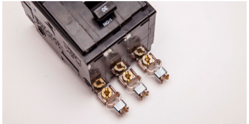
3 phase QOB breaker with jaw kits installed