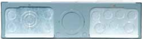
Load center end wall with both plates installed

Longer covers now available for both HomeLine™ and QO™ load centers