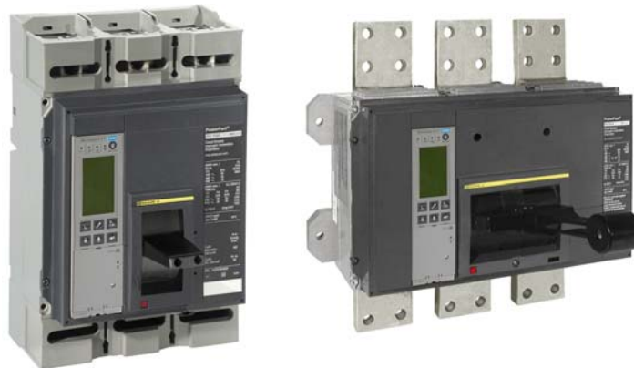
Figure 3 – PowerPact™ P- and R-Frame Circuit Breakers with Micrologic Electronic Trip Units

NOTE: All Micrologic P- and H-trip units with the blue ERMS label are suitable for ERMS applications.