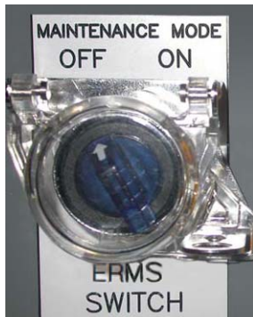
Figure 5 – Local ERMS Switch

The ERMS switch (see Figure 5) temporarily lowers the instantaneous pickup of the circuit breaker to a pre-programmed value and provides a circuit protection system with two modes: a normal mode and a maintenance mode (in which potential arc flash energy is reduced).