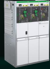
SF6 Free Solution : RM AirSeT