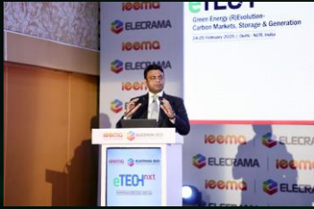
Keynote speeches by Schneider Leaders