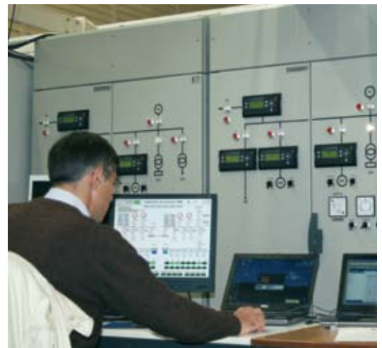
Power management system for ship with electrical propulsion