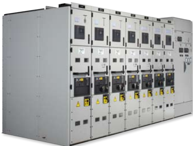
Combatant ship equipped with MV and LV distribution according high constraints, shocks, vibrations...