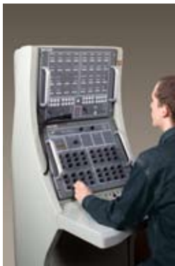
Workstation for the supervision and control of sub-systems