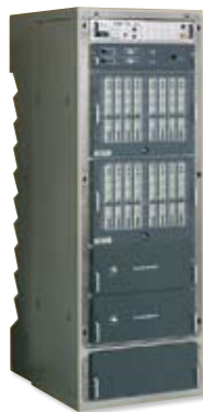
Data collecting and operation status checking