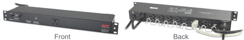
Figure 3 An example of a rack-mount surge protection device

If your application doesn't require a UPS, plug your IT equipment into a surge protection device like the one shown in Figure 3 . Plugging your IT equipment into “raw” utility, may result in damaging the IT equipment due to impulse power transients. Note that rack PDUs typically do not protect equipment against voltage spikes. Rack PDUs are typically fed by a UPS which includes surge protection.