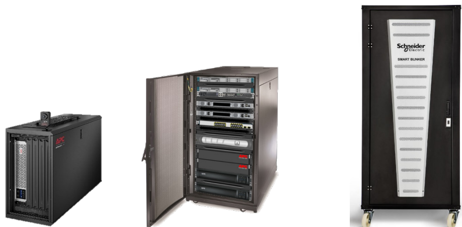
6U micro data center