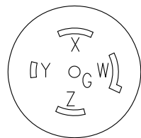
DETAIL B (NEMA L21-20P PLUG-ENLARGED)