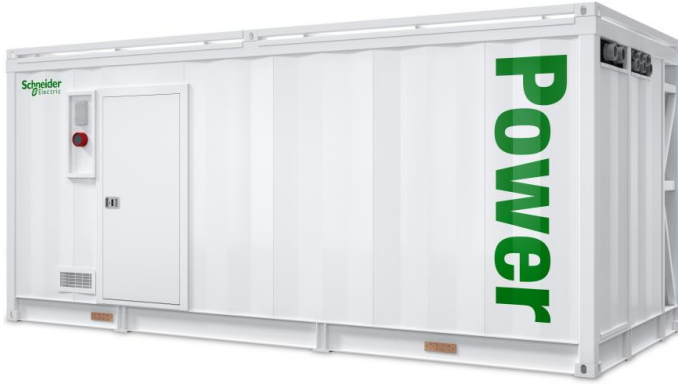
Symmetra PX 250 kW UPS

Schneider Electric offers scalable, easy-to-deploy, Prefabricated Data Center Modules.