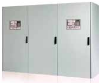
SDC Rectifier 24 – 220 V 25 – 1200 A