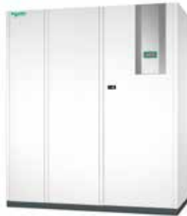
Precision Air Conditioning Range