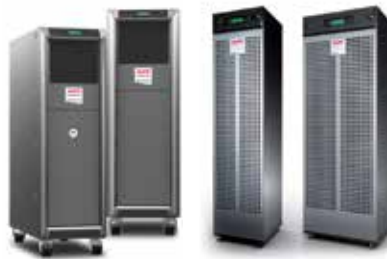
MGE Galaxy 300 / MGE Galaxy 3500 UPS