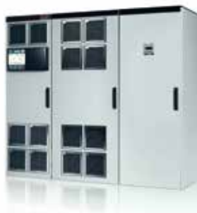
PXP AC UPS Systems 5 to 160 kVA

As a provider of complete secure power solutions, GUTOR covers all elements of a project from initial consultation to engineering, assembly and testing. GUTOR's dedication to long-term relationships with its customers is also facilitated through its spare part, preventive and corrective maintenance, upgrade, training and inspection capabilities, which all guarantee longevity of service.