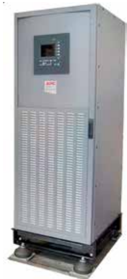
MGE Galaxy 5000 Marine UPS