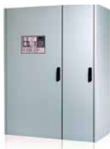
PxW AC UPS Systems 5 to 220 kVA