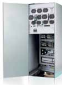
Mxx AC & DC Modular UPS up to 25 kW