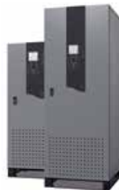
Static Transfer Switch