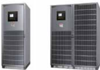
MGE Galaxy 5000 / MGE Galaxy 7000 UPS