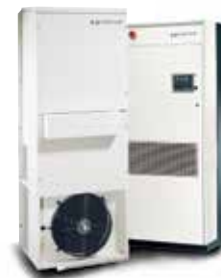
Mobile Telecom Air Conditioning Range