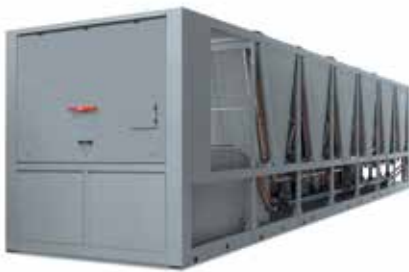
Complete Chiller Range from 6 to 1,200 kW